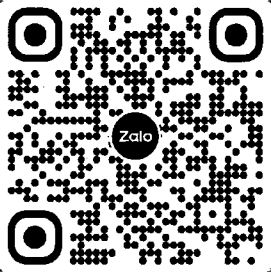
QR code for viewing 2025 AGM's documents